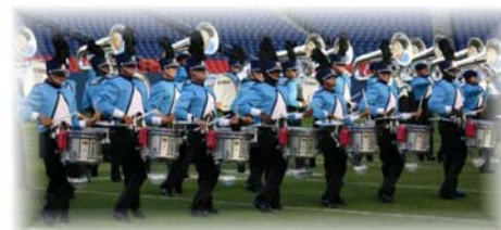
Spirit from JSU

bama will be June 22 at Spain Park High School, July 18 at Jacksonville State University, July 25 at Troy University, and July 26 in Russellville.